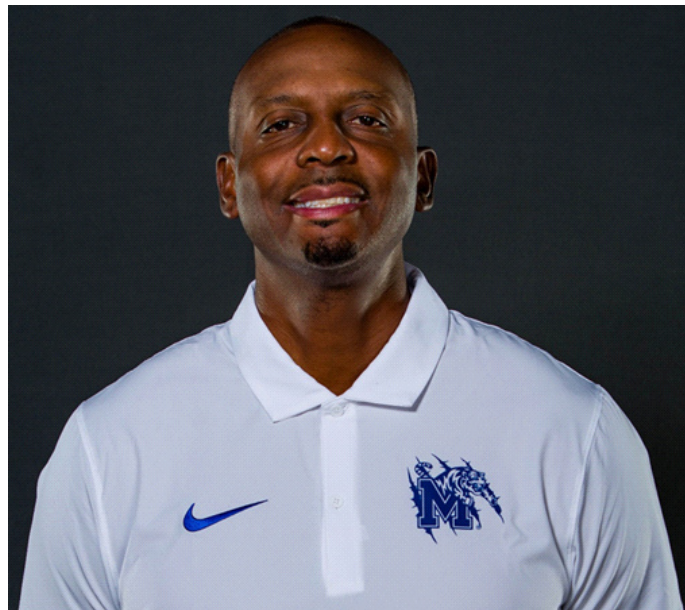
Coach Penny Hardaway

IRVING, Texas, March 11, 2025 – After finishing the regular season ranked 16th in the country with a 26-5 overall record and the American Athletic Conference outright regular-season title in hand for the first time in program history, the University of Memphis men's basketball program received a multitude of postseason awards from the league office Tuesday. The official AAC awards are selected by the league's head coaches, and